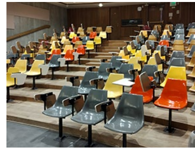
Figure 2: Unrenovated fixed seat lecture room in Bond Hall

The 2023-25 request will complement the program by addressing Western’s large backlog of classrooms and labs that need utilization, technological, and safety improvements. Some of the projects included in the 2023-25 project were requested in the previous biennium but unfunded, including 5 fixed seating lecture halls and 10 instructional labs. Additionally, this is the first year that Western will include collaborative space as part of the program due to emerging importance of these type spaces.