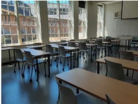
Figure 3: Renovated classroom with flexible seating, upgraded AV and lighting, and dual white boards in Bond Hall

The proposed 2023-25 Classroom, Lab, and Collaborative Space Upgrades will impact academic programs across the university. The project will increase the utilization of general use and specialized instructional space, provide broader institutional efficiencies through centralized control and monitoring of non-specialized learning areas, and expand institutional capacity by increasing the overall performance of these physical assets. Students and faculty in every degree and academic department will benefit from the modernization and increased access to Flexible Learning environments.