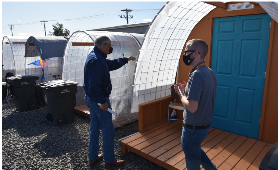
The Walla Walla Alliance for the Homeless Sleep Center provides a safe place for nearly half of the valley's unsheltered homeless population. On most nights, about 45 people find respite there.

As of October, a high number of Washington households – over 80,000 – reported they were likely facing eviction or foreclosure in the next two months, according to the Census Bureau Household Pulse survey . Meanwhile, due to social distancing requirements to prevent the spread of COVID-19, local shelter capacity has been squeezed.