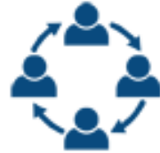
Communications & Collaboration